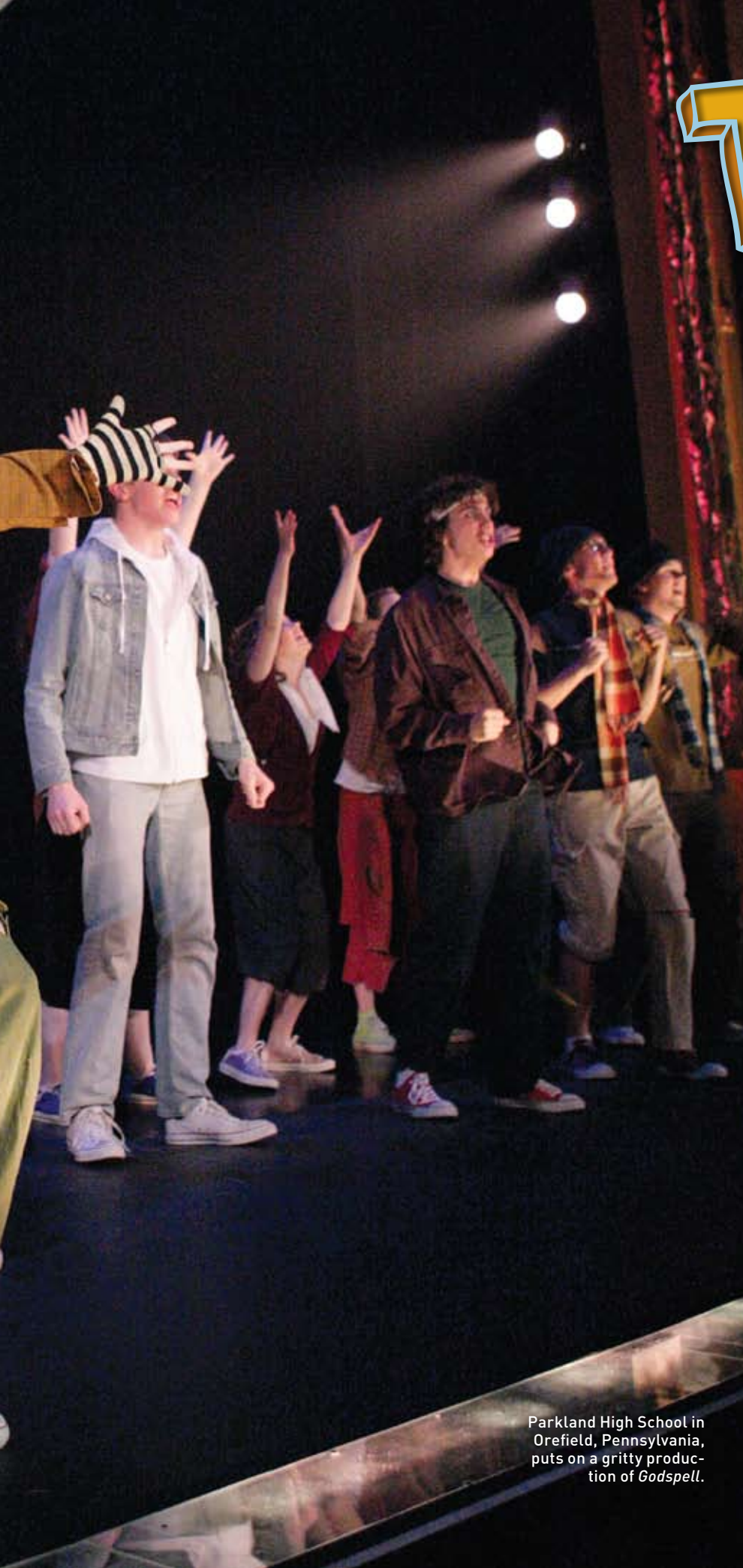
Parkland High School in Orefield, Pennsylvania, puts on a gritty production of Godspell .