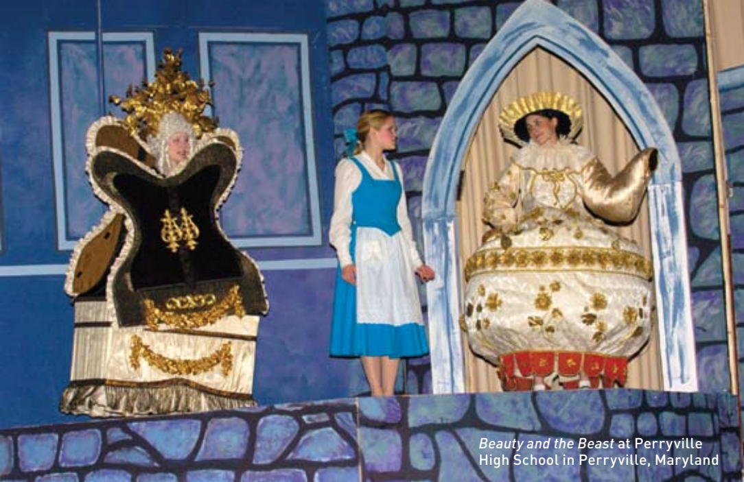
Beauty and the Beast at Perryville High School in Perryville, Maryland